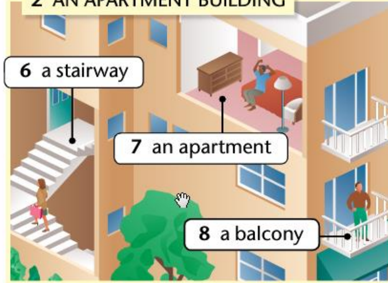
2 AN APARTMENT BUILDING