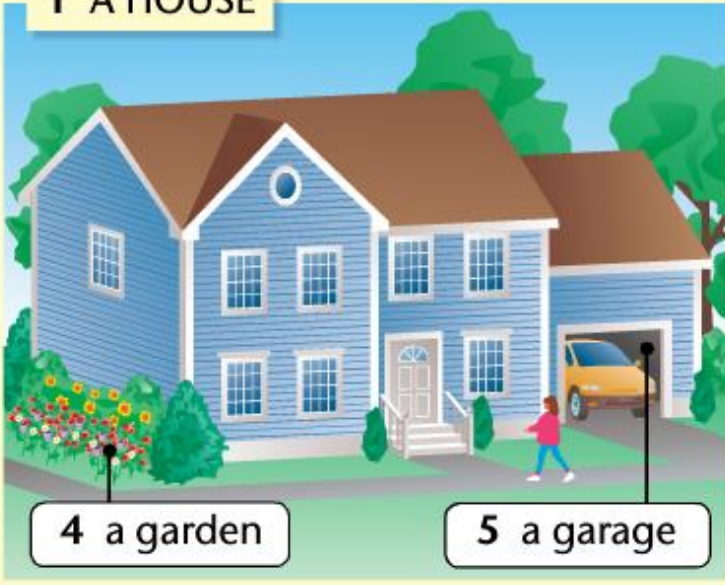
1 A HOUSE