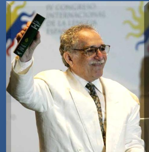
Gabriel García Márquez